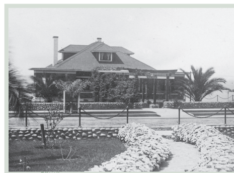
At left, Wisteria Cottage in 1921 and below, as it looks today, awaiting further restoration

The La Jolla Historical Society connects our community to its past. Please join us as a "Partner for History" as we raise $2 million to restore historic Wisteria Cottage.